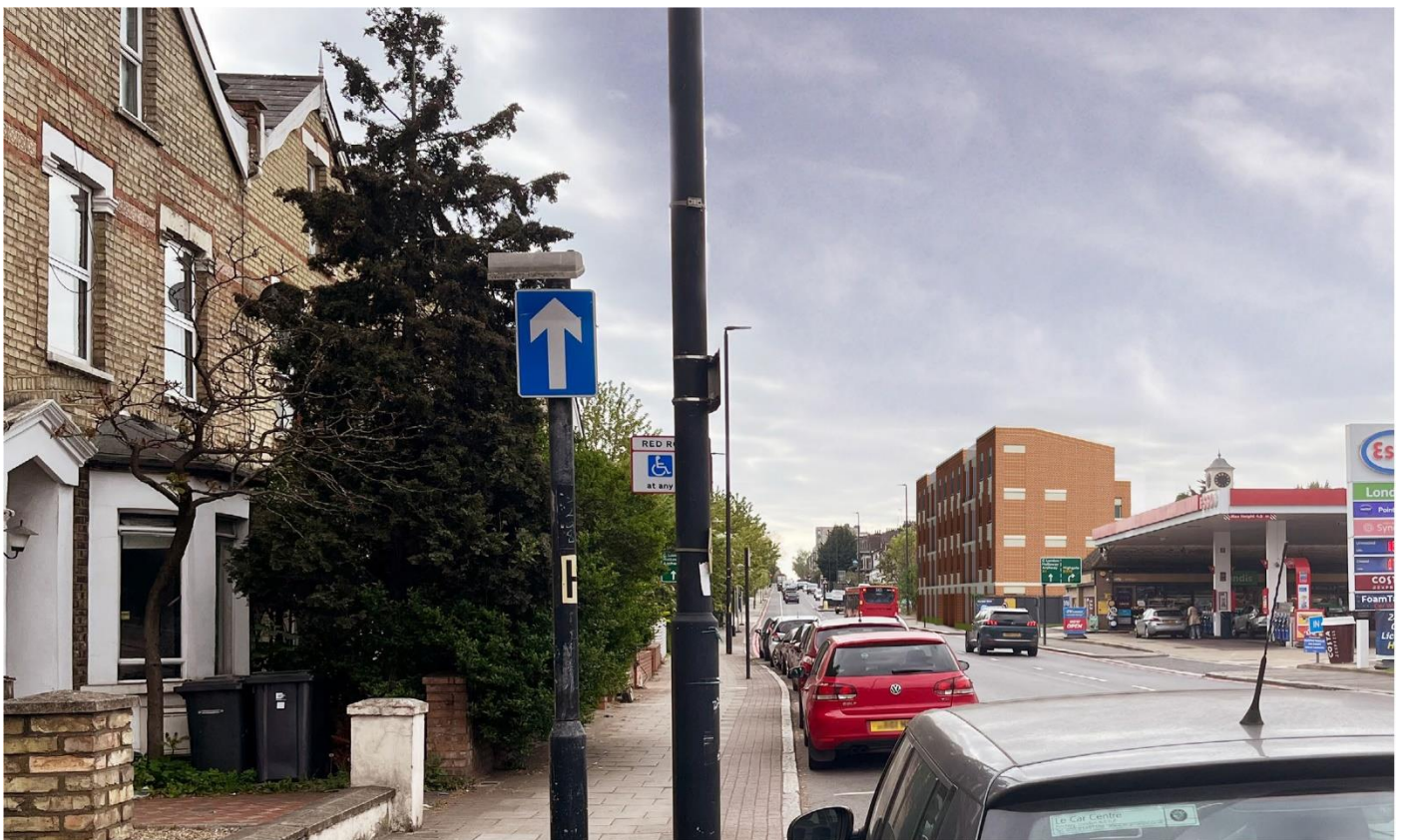
View 4 – Archway Road looking South-East