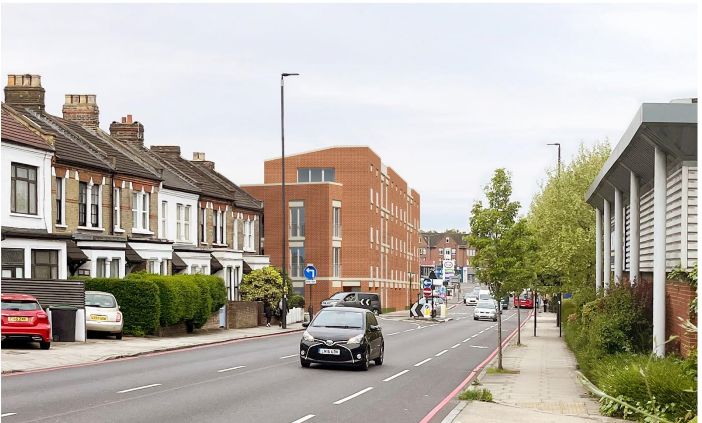
View 2 – Archway Road looking North West