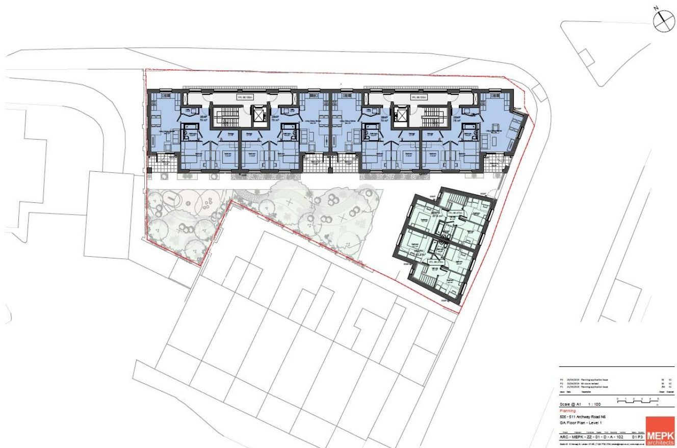
Floorplan – Level 1