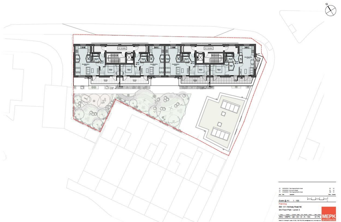
Floorplan – Level 3