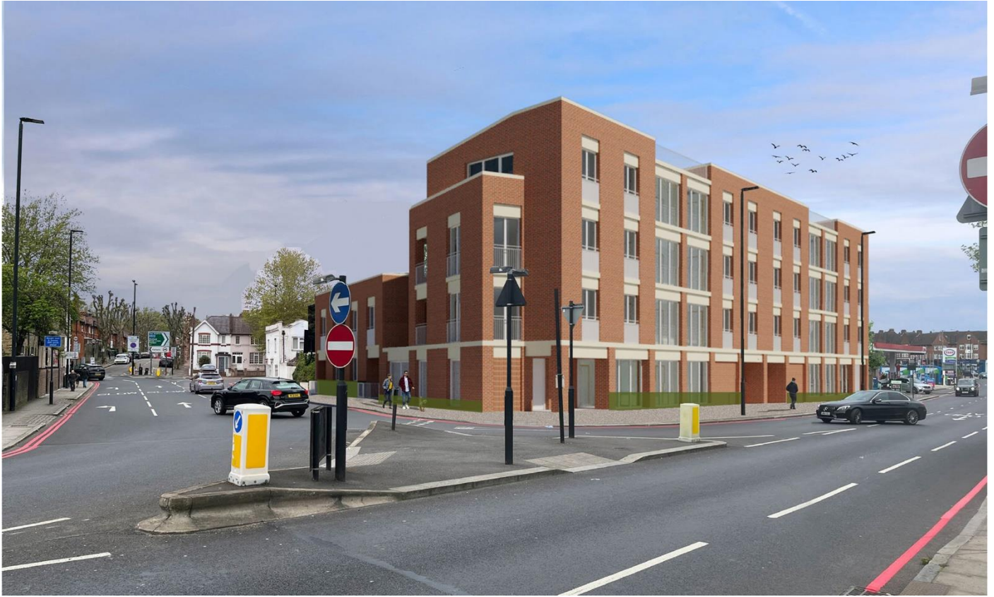
View 1 – Junction of Archway Road and Bakers Lane