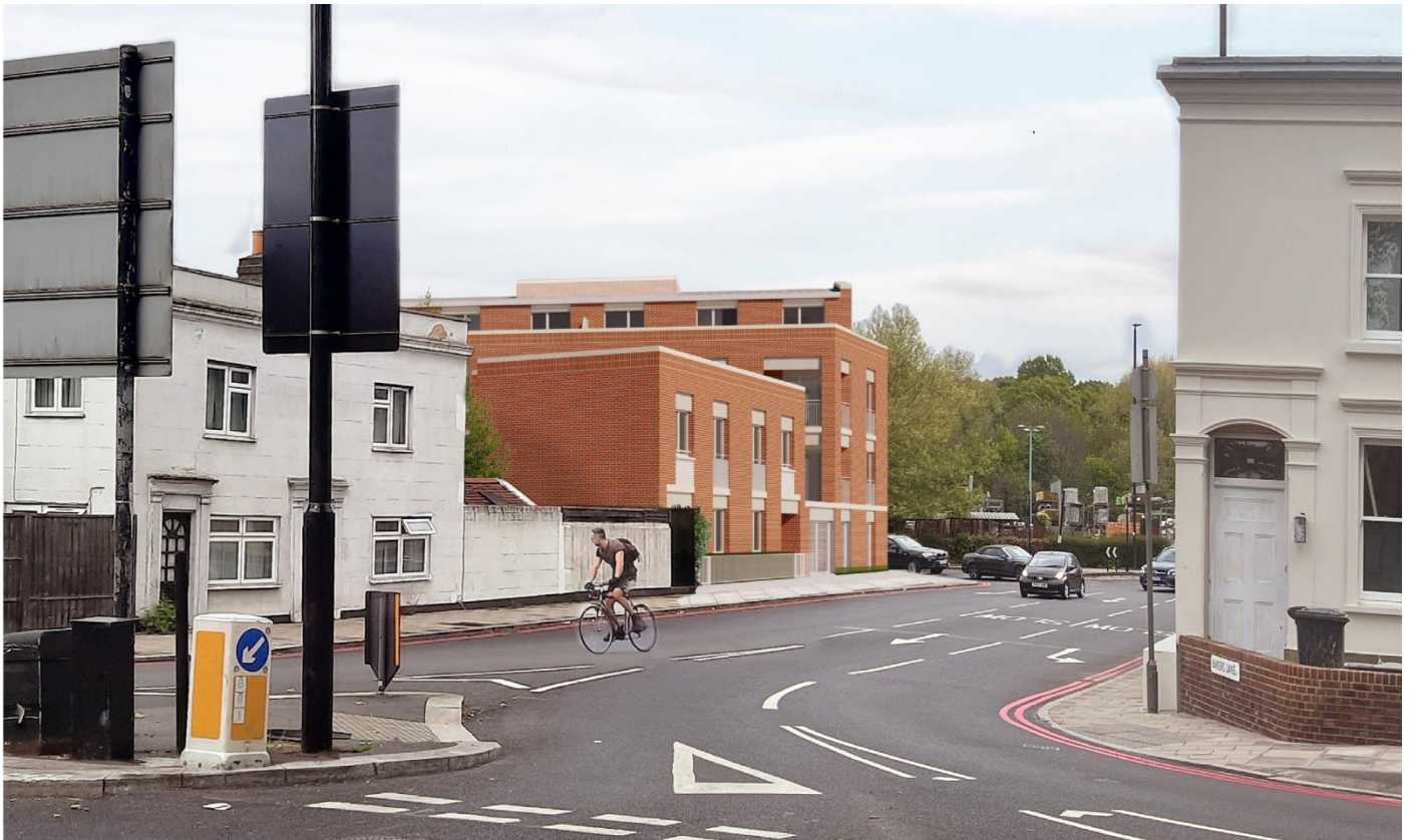
View 3 – Bakers Lane looking towards Archway Road