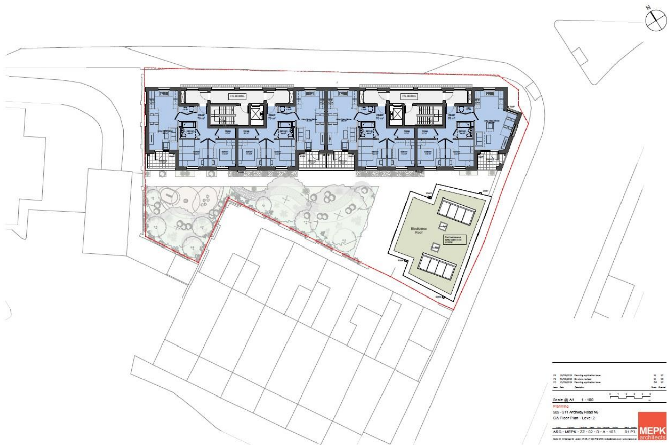
Floorplan – Level 2